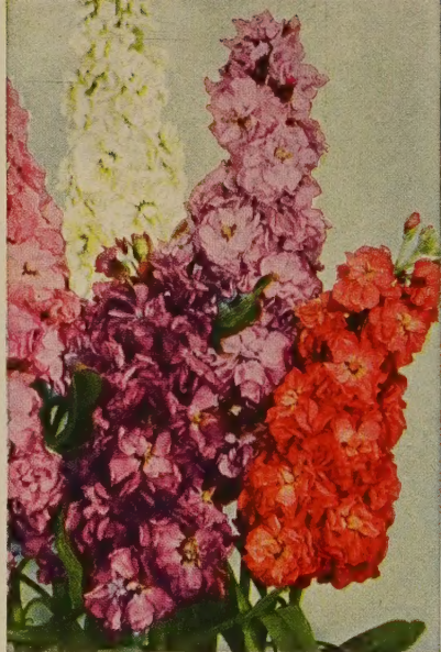
IMPERIAL GIANT STOCKS

Chater's Double Mixed Five to 6 ft. tall, with large, double blooms in crimson, maroon, pink, white, and yellow. Pkt. 15c; \frac{1}{4} oz. 75c